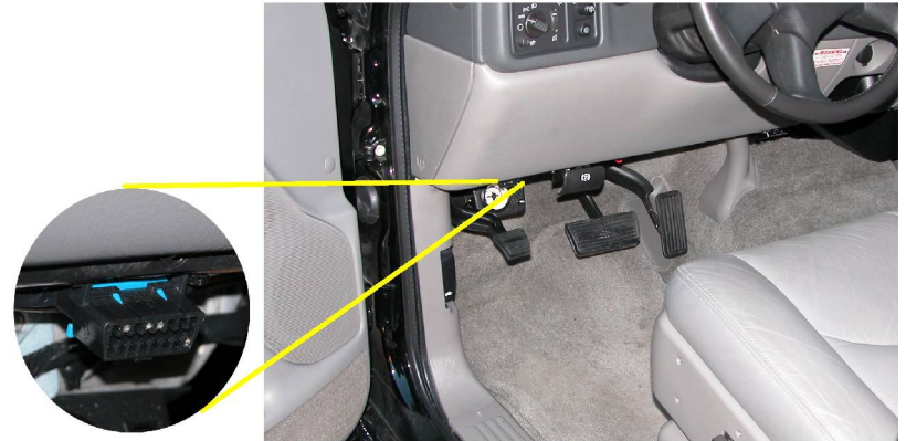
Illustration 1: Diagnostics Port / OBDII Connector

The Window Valet™ Sport plugs into the diagnostics port. This port is located on the front dash just to the left of the driver area in many vehicles. In some cases, it may be just below the edge of the dash trim, just above the driver leg area. Please see Figure 1 for example location: